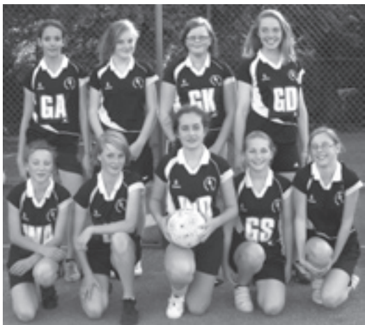
The formidable Year 9s!