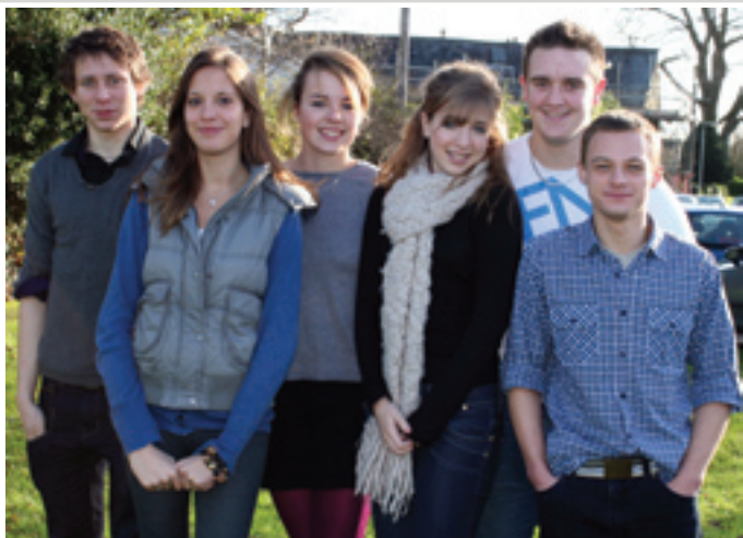
The 2010 group: