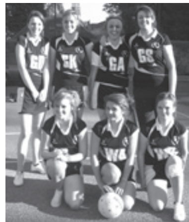
The Year 11 team